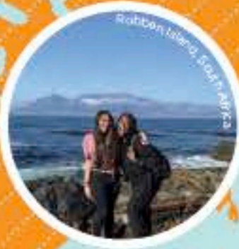
Solomon Islands, South Pacific